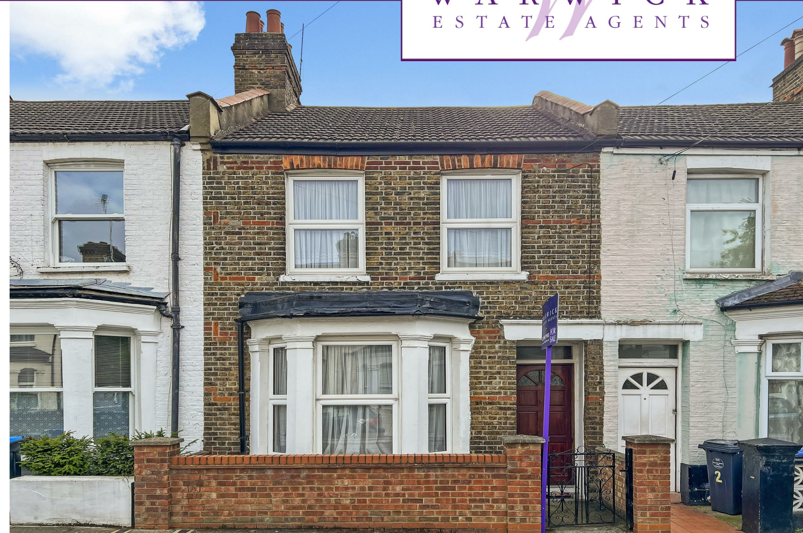
Earlsmead Road, Kensal Green, NW10 5QB